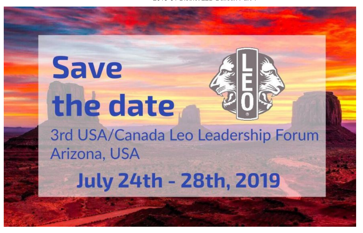
REGISTRATION IS NOW OPEN