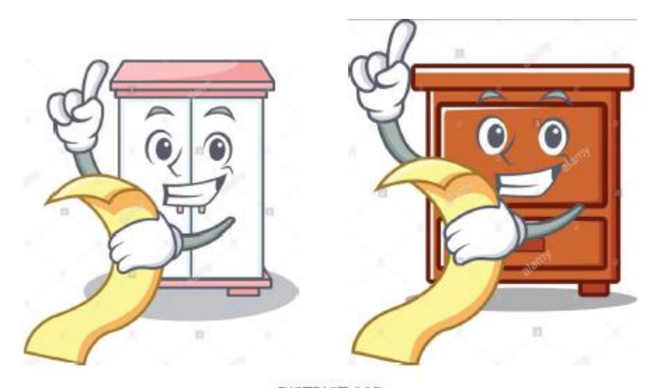
DISTRICT 22D 3rd Cabinet Meeting

February 5, 2019, at 5 pm (meeting at 6 pm) Modern Maturity Center, 1121 Forrest Ave, Dover, DE 19904