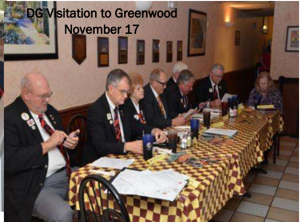
DG Visitation to Greenwood November 17