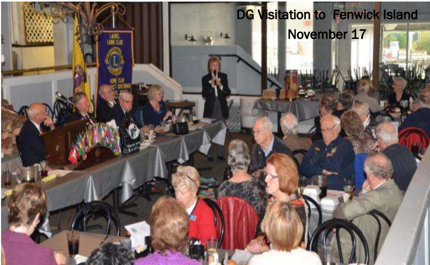
DG Visitation to Fenwick Island November 17