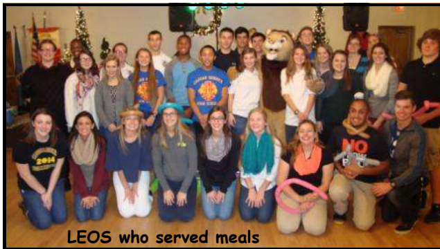
LEOS who served meals