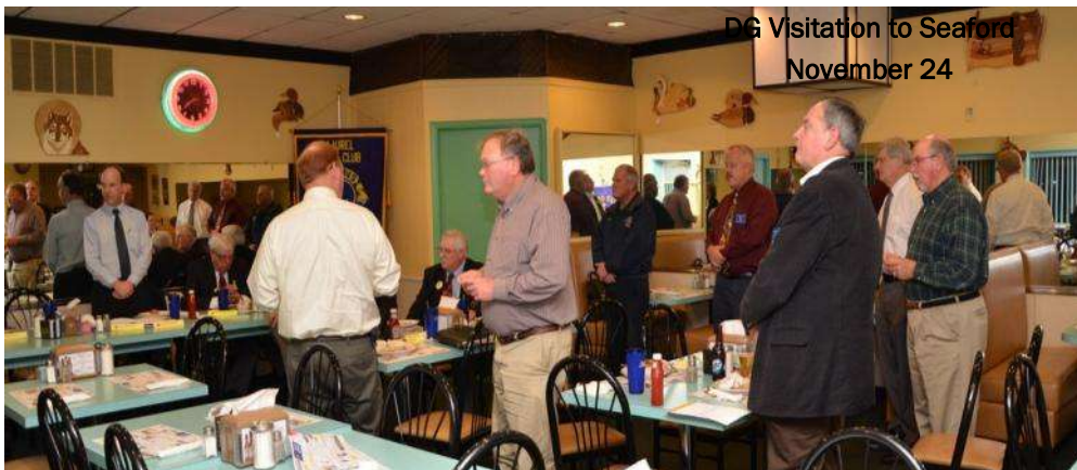
DG Visitation to Seaford November 24