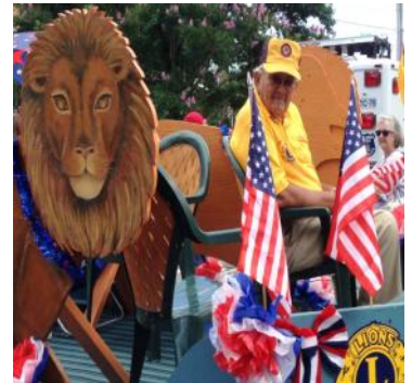
Last years float.