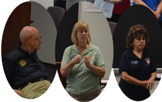
The Instructors from Club Officer Training School are pictured above and to the left.