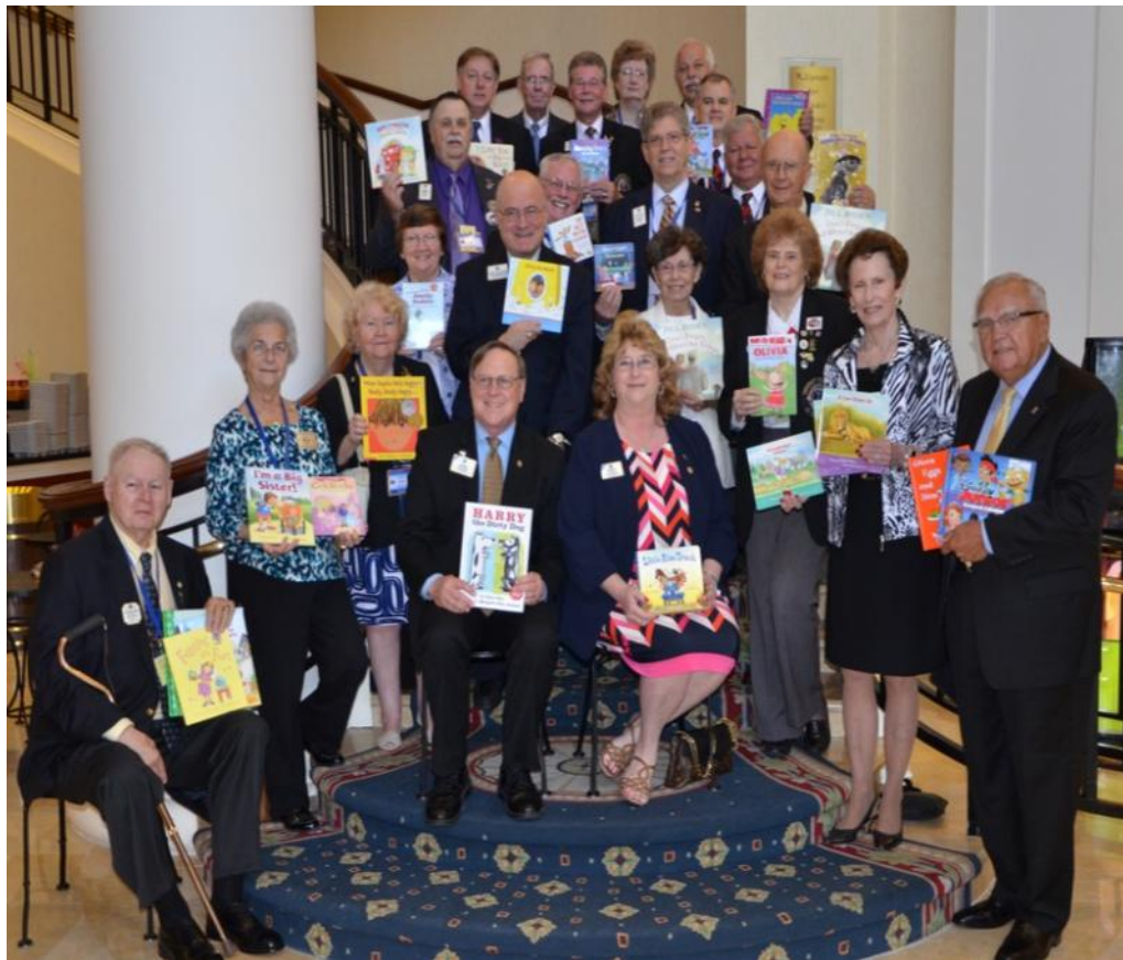
Many children's books were collected as a MD Project for World Wide Week of Service to help children in need.