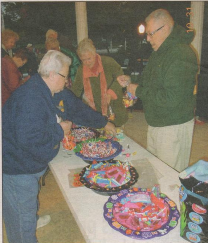
HALLOWEEN IN BRIDGEVILLE - On Halloween in Bridgeville, Bridgeville Lions Club and Lionesses stuffed bags of candy for area children. Children and their families went to Cahill Park, Bridgeville, to receive bags of candy, chips, little cakes and cups of cider for all.