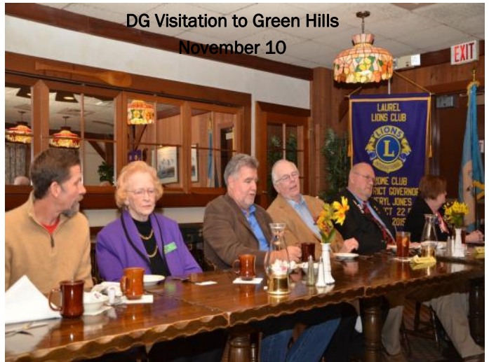
DG Visitation to Green Hills November 10