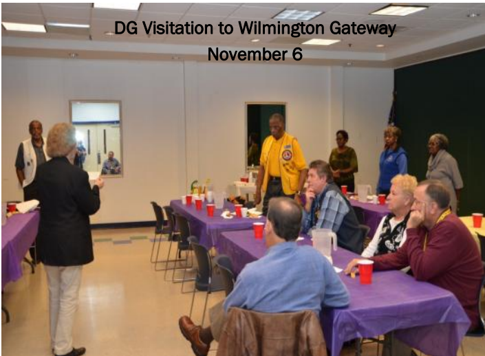
DG Visitation to Wilmington Gateway November 6