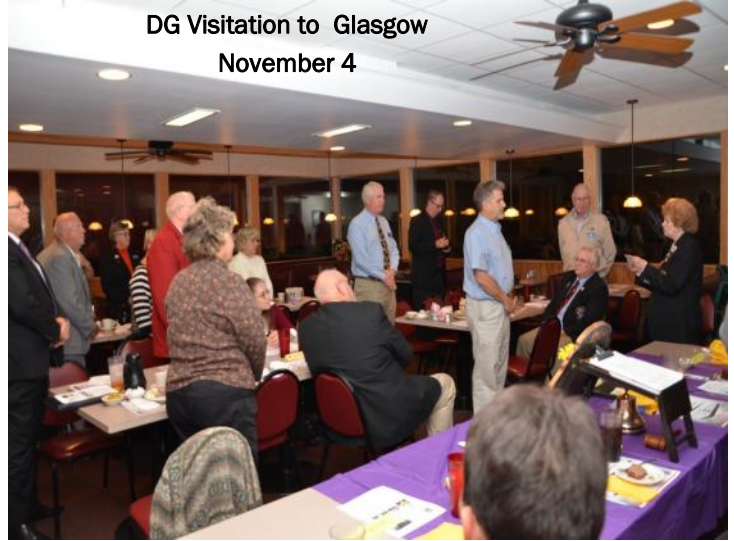
DG Visitation to Glasgow November 4