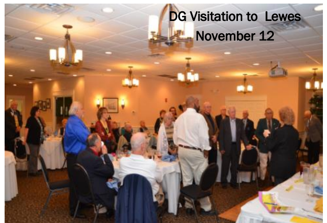
DG Visitation to Lewes November 12