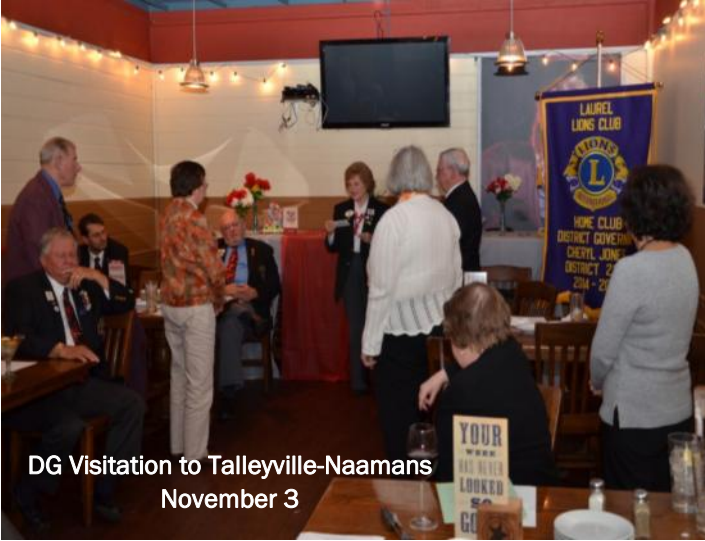
DG Visitation to Talleyville-Naamans November 3