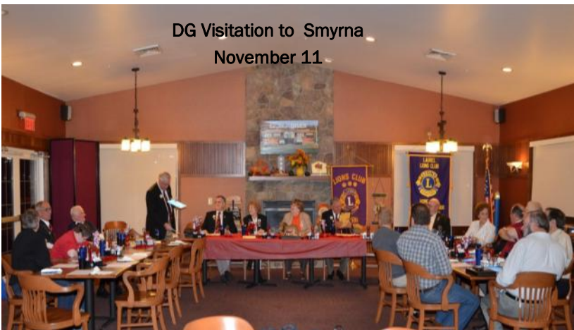
DG Visitation to Smyrna November 11